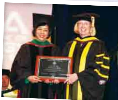
Honorary Fellow of American College of Radiology, 2009