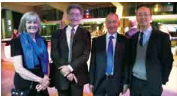
President's Reception of Annual Conferment Ceremony of RANZCR