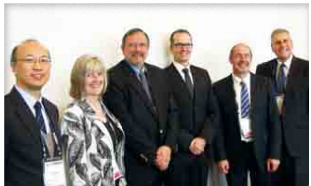
Group photo after an informal lunch meeting.