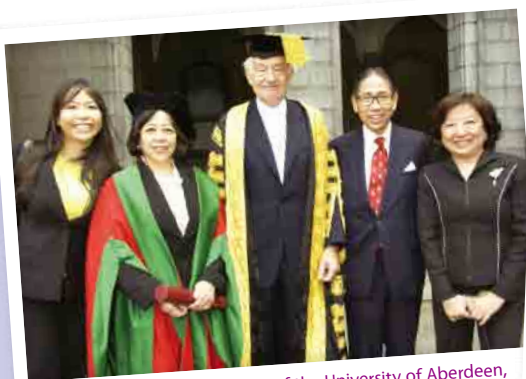
Honorary Doctorate of Science of the University of Aberdeen, UK, 2007