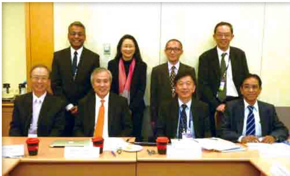
Executive Council Meeting of AOSR on 27 October 2011 in Seoul during the KCR

The KRC is a truly international meeting. There were a number of international speakers and many sessions were in English. I met a few Hong Kong radiologists and radiographers during the meeting, some of them doing oral presentations also. It is a healthy trend towards closer collaboration and more frequent exchange of radiology knowledge in our region. Due to my duty in the Final Examination for the Fellowship of RCR and HKCR and the Joint Meeting of the Colleges' Council, I could only stay in the meeting for 1 day. I am looking forward to another chance to go back soon. ✎