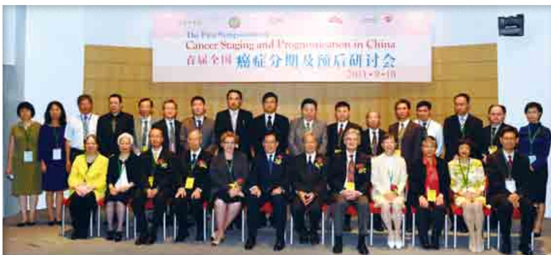
Group photos of guests, speakers, Society's Executive Council members and Symposium Organizing & Scientific Subcommittee members

The symposium was a great success in stimulating the interest of Chinese colleagues to adopt the international staging system, and serving as a bridge to enhance collaboration with the international community for further improvement of staging system and prognostication. ✎