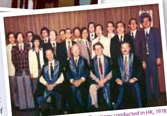
First FRCR Fellowship Admission Ceremony conducted in HK, 1978