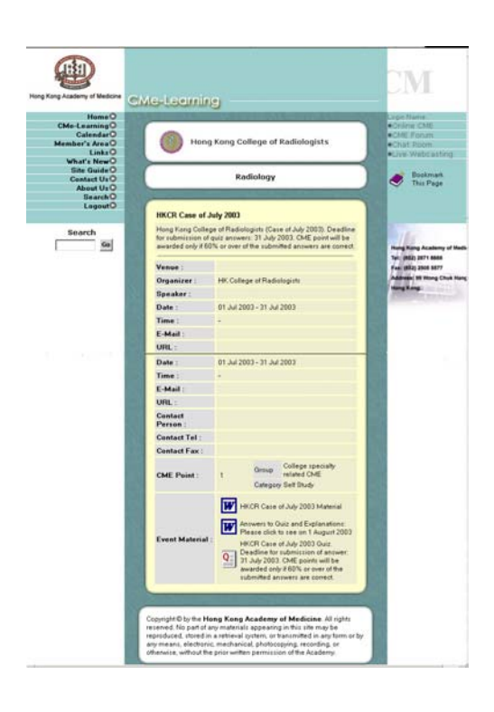
The Final Page where you can view the Case of the Month and get CME