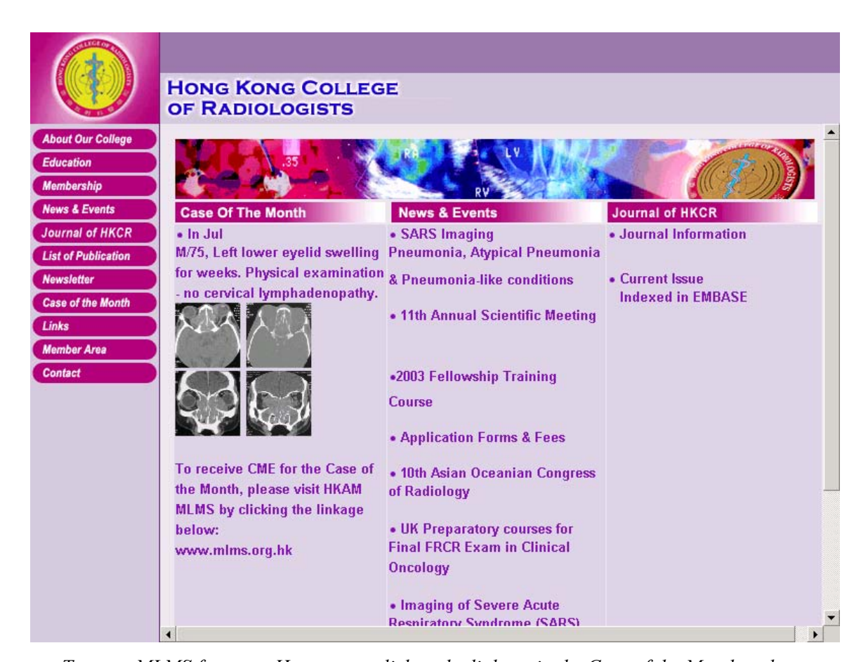
To go to MLMS from our Homepage, click at the linkage in the Case of the Month column

Starting from July 2003, our Case of the Month will also be CME accredited. A linkage had been set in the Case of the Month of our Homepage to the MLMS website. After studying the current Case of the Month and answer the 5 MCQs set by the author, you will get 1 CME point for correct answers reaching 60% or more in your first attempt. Notice that CME will only be given to the current Case of the Month. The case of that month will automatically expire by the end of the month and will be replaced by a case of the next month. Retrieval of cases of the past months are possible from the homepage of the Hong Kong College of Radiologists as before.