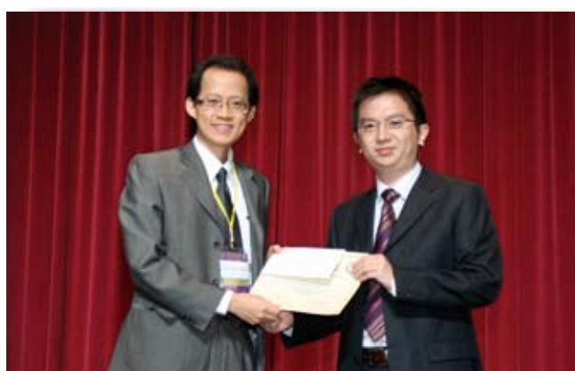
Awards Presentation of Proffered Papers Presentation in Radiology (Top), Clinical Oncology (Middle) & Nuclear Medicine (Bottom)