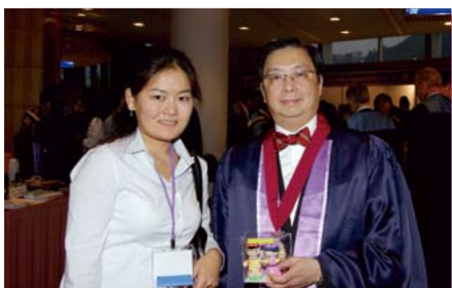
Young radiologists from Mainland (Top), Malaysia (Middle) & Mongolia (Bottom) received the Education and Research Fund for attending the meeting