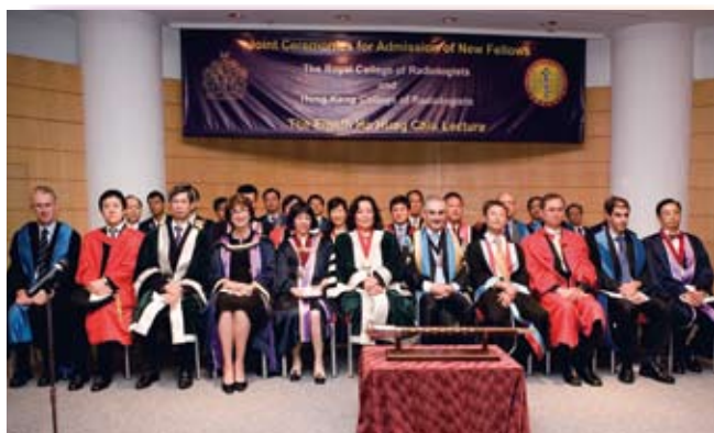
Stage Party of 7th Joint Admission Ceremonies of RCR & HKCR