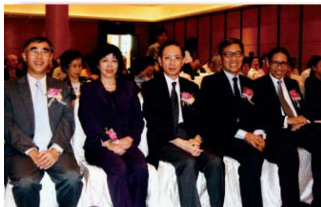
Photos taken at 2007/2008 Structured CME Programme Opening Ceremony on 17 June 2007 at Macau Tower Convention and Entertainment Centre