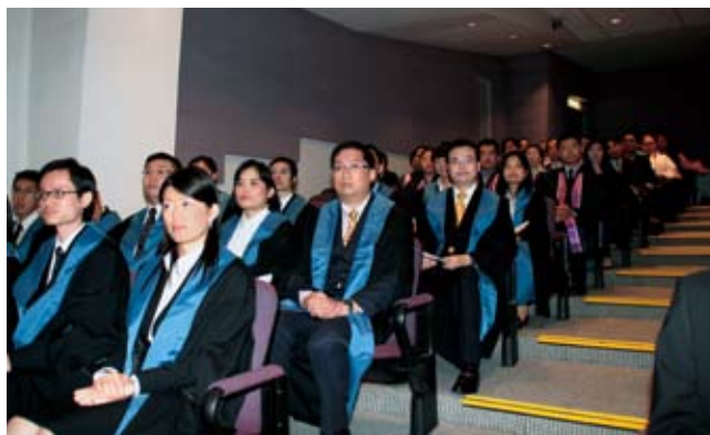
New Fellows of RCR & HKCR