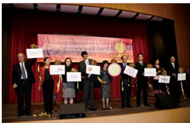
UK Travelling Scholarship Launching Ceremony