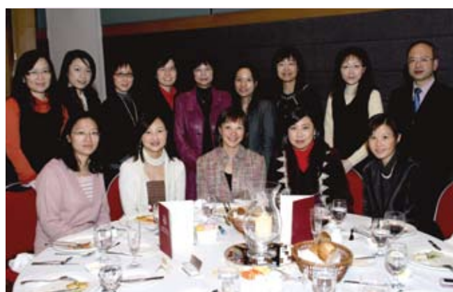
Secretariat & Volunteer Helper