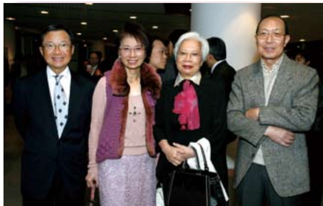
Cocktail reception at 15 th Anniversary Celebration