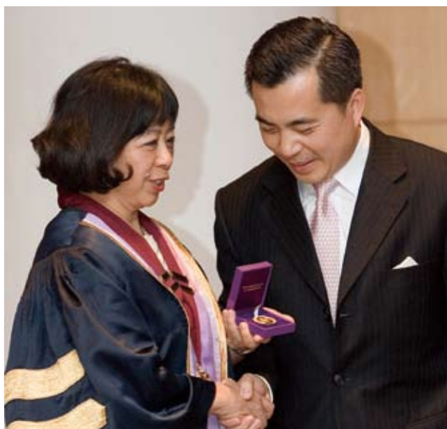
Souvenir Presentation The Hon. Wong Yan Lung, SC, JP