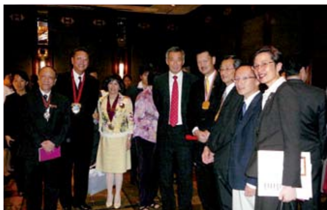
At the cocktail reception of the Congress: HKCR delegation taken with Mr. Lee Hsien Loong, Prime Minister of Singapore, and Presidents of other HKAM Colleges.