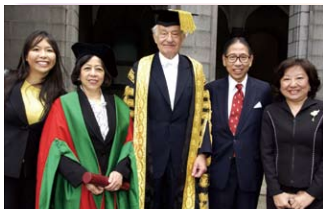
Photos taken at Graduation Ceremony on 5 July 2007