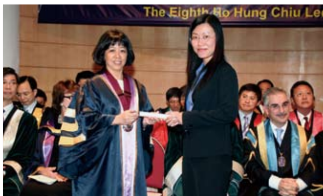
Certificate Presentation for Successful candidates in the First Palliative Medicine Subspecialty Board Examination of HKCR