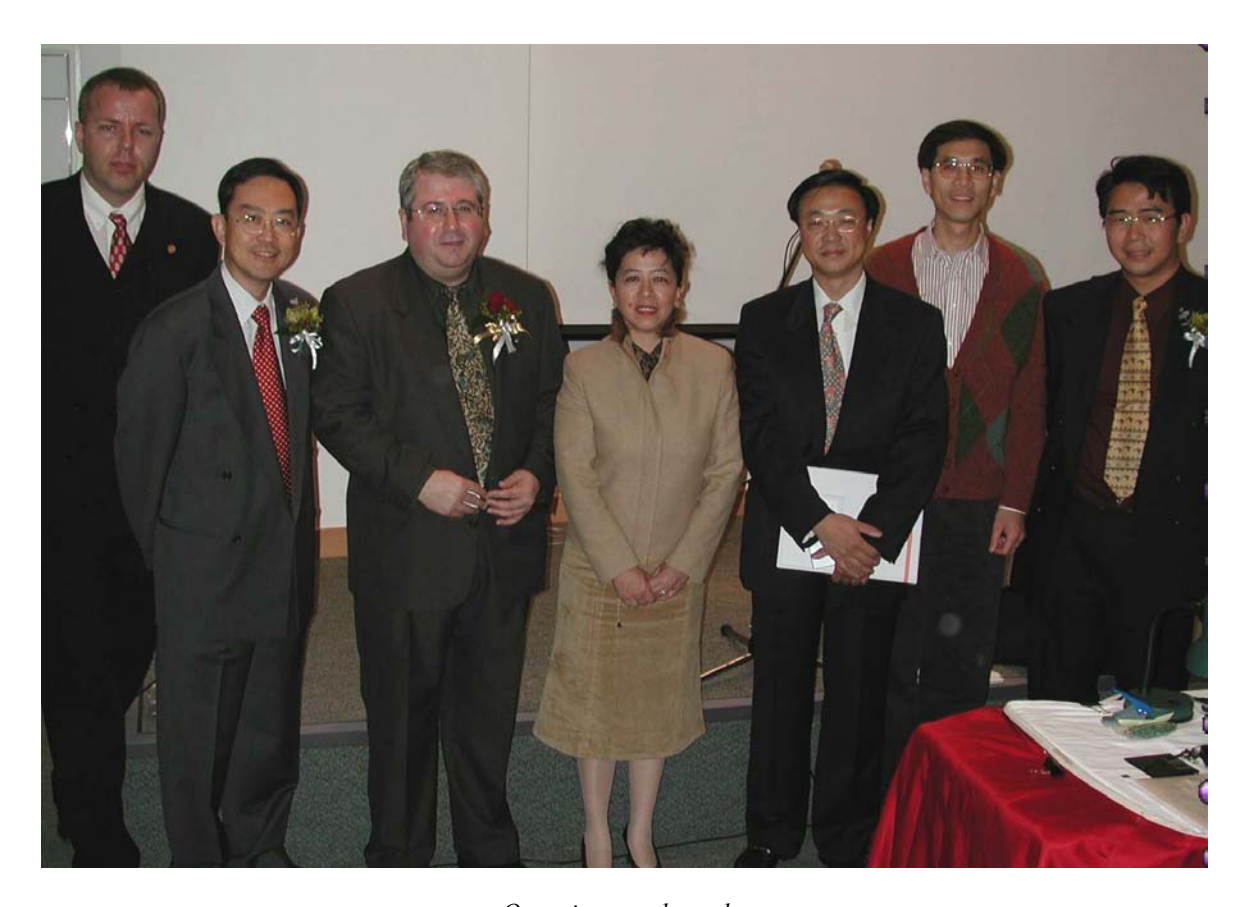
Organizers and speakers

The seminar was sponsored by AGFA Hong Kong Ltd.